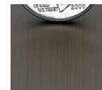
Anodized - Bronze