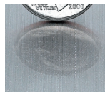
Brushed Clear - Powder Coat