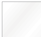
Polycarbonate - Clear