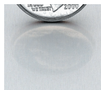
Anodized - Polished