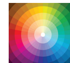
Paint or Print - Custom Colors

Learn more at GemstarMfg.com/panel-mount