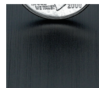
Anodized - Black