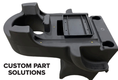
CUSTOM PART SOLUTIONS